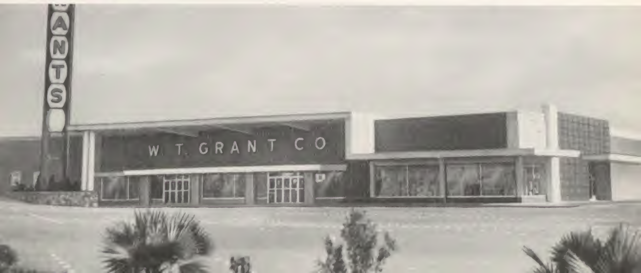
San Diego, Calif.

It is planned to continue our emphasis on park-and-shop stores in 1956.